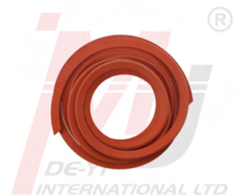
Rocker Lever Cover Seal 3905449

MJ has a complete product line for Cummins engines, please get in touch with us for more. If you have any concerns or questions about making an international purchase, check out our FAQ page for more details or contact the MJ sales team.