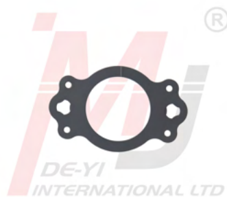
Exhaust Manifold Gasket 5316185